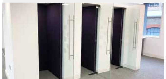
Clockwise from left: Kitchen and break area, main office space, private work booths