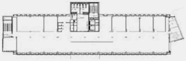
*Floor plan not to scale