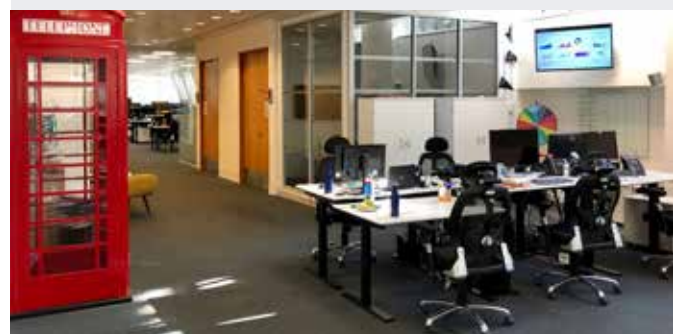
Clockwise from left: Main office space, meeting room, open plan desks