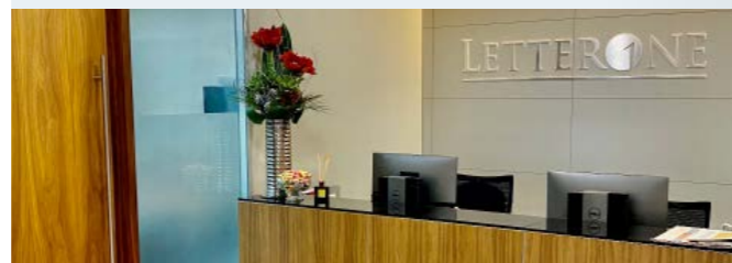
Clockwise from left: Main office space, meeting room, reception