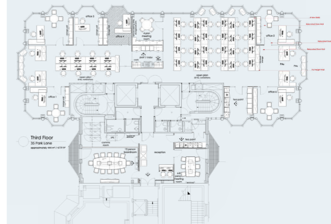
*Floor plan not to scale